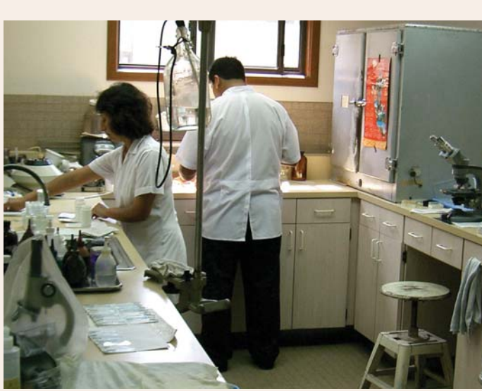
Clinic workers conduct tests in the laboratory.