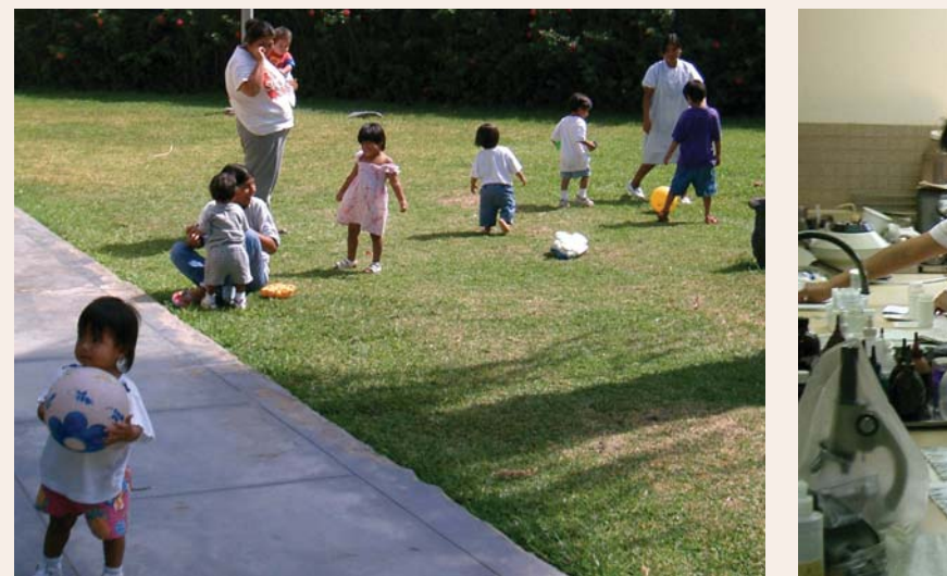
AN ISLAND OF HOPE: Orphans play at the Social Works Center.