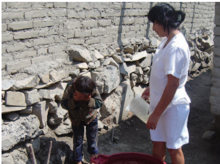
A child washes himself.